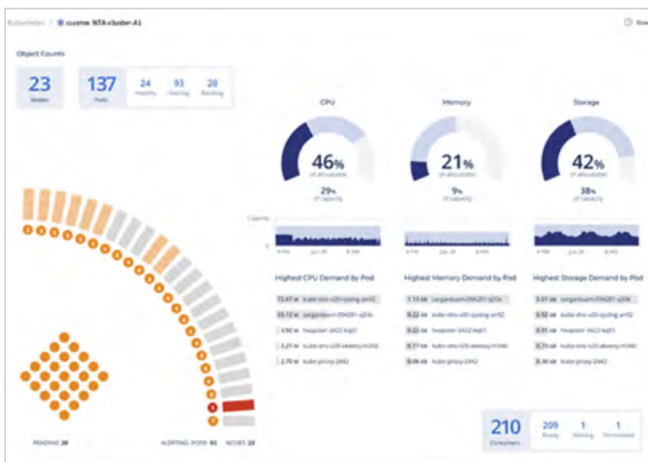
Kubernetes dashboard showing clusters and utilization

Active IQ's predictive analytics directly visible from Cloud Insights. Directly identify Active IQ risks and take advantage of prescriptive guidance.